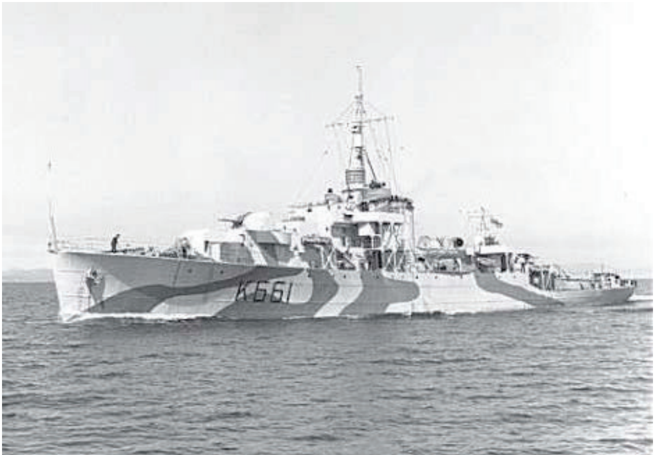
HMCS Antigone during the period when Ken worked as a stoker