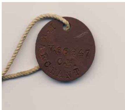
Ken's bakelite 'dog tag' found years later

After training, it was back to Halifax, where we joined 4 other ships as a striking force called E-G 16. We patrolled between Halifax, New York, and Newfoundland looking for Subs. Looking for subs was scary sometimes as you never knew where the subs were. One time we had torpedoes fired at us, but they missed. We also spread out heading up the St. Lawrence. Many times we were escorting convoys half way across to England. We once came upon a ship that had been sunk, and found the crew on Carley Floats, frozen to death. They had lots of food and water, but could not last in the frigid temperatures.