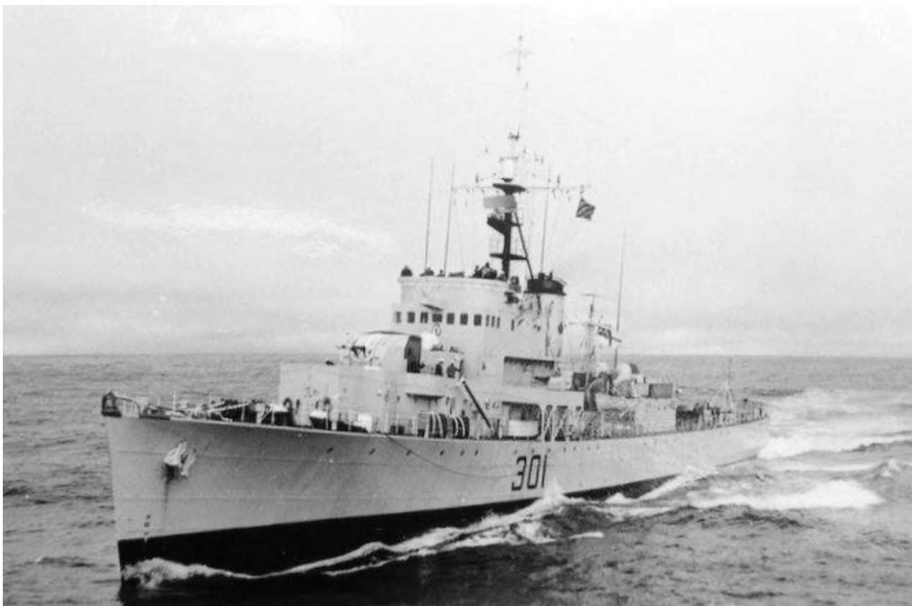
HMCS Antigone in 1962, after being rebuilt as a training ship